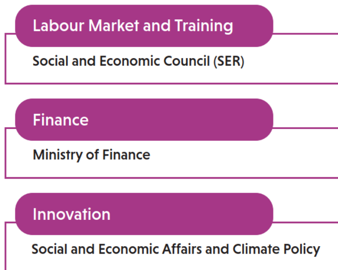
Figure 2 Cross-sectoral executive committees and the councils or ministries responsible for them.